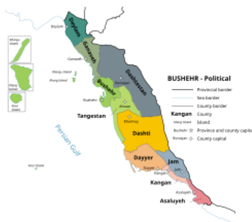
Figure 1. The geographical location of Coastal Regions of Bushehr

consists of highland fingers within a plateau (Britannica, 2020). The Shāpūr River drains the region and serves as an inland waterway from the Persian Gulf coast at Būshehr, the region's capital. Rainfall in the region is low and sporadic. Agriculture is the main occupation; Crops include wheat, barley, date palms, mangoes and citrus fruits. The industry produces woven fabrics, milled rice and flour, building materials and processed foods. The region is home to numerous oil and natural gas fields and there are natural gas pipelines from the interior to the coastal town of Kangān. Kharg Island is located in the Persian Gulf 34 miles (55 km) northwest of the city of Būshehr and is a major crude oil terminal (Britannica, 2020).