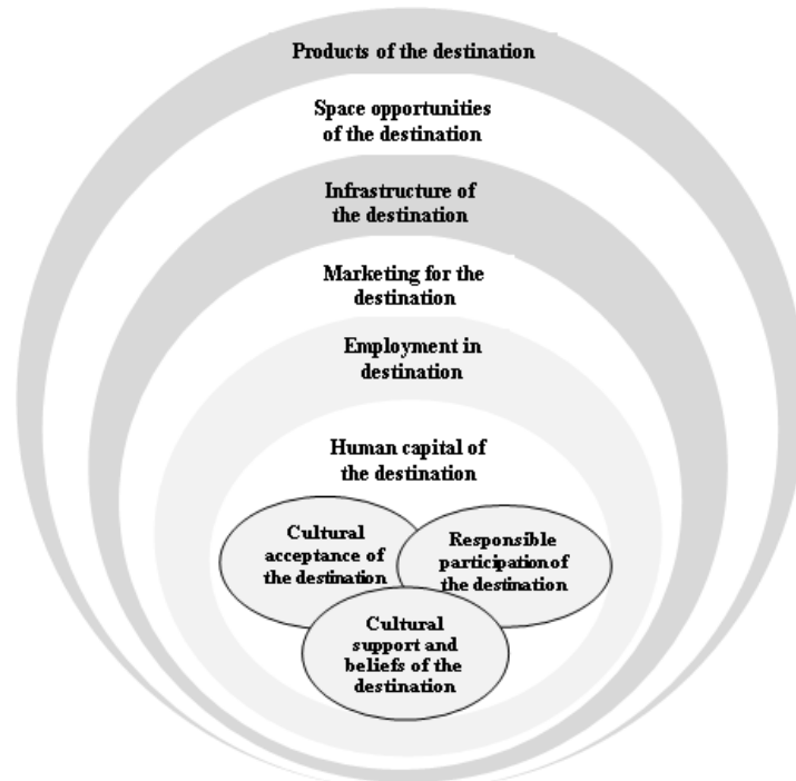
Figure 2. The initial framework for the development of tourist destination villages in Rahmatabad and Blukat, Rudbar, Guilan