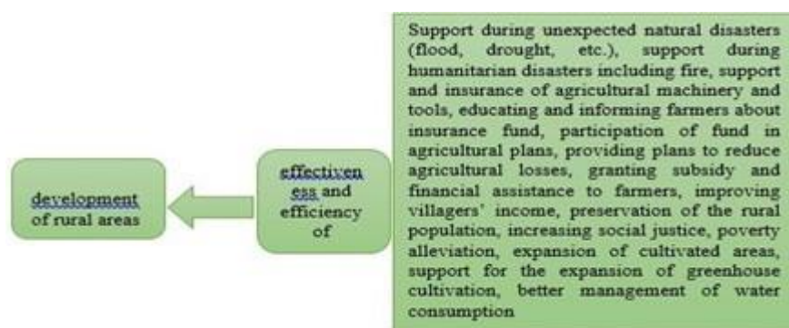
Figure 1. Conceptual model of the research

agricultural insurance program was acceptable according to effective criteria. In this regard, assurance and expanding insurance services can play the most significant role in farmers’ satisfaction. Zeng et al., (2022) in a study on “agricultural insurance and economic growth”, concluded that agricultural insurance supports farmers and sustainable production, contributing to long-term economic growth. Investigating the agricultural insurance performance, Timu & Kramer (2023) emphasized that while insurance is a suitable support mechanism for agriculture, its implementation and policies are crucial for its efficacy. Analysis of past research and comparison with the present study shows that unlike many past studies, this research emphasizes on the agricultural insurance fund. Furthermore, an attempt has been made to establish a research framework in line with the duties of this fund. Additionally, this study examines the effectiveness and efficiency of the agricultural insurance fund, which has not been significantly addressed in past research. Therefore, the present study is innovative in these aspects.