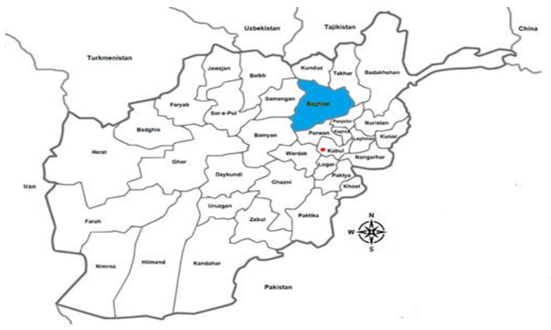
Figure 1. Map of Afghanistan and the study area

The area studied in this research was Baghlan Province. Baghlan Province is one of the important agricultural provinces industrial and Afghanistan. Baghlan is located 230 km from Kabul along the Kabul-Mazar-e-Sharif highway. This province is a part of the northeastern provinces and connects eight Northern provinces of the country with the capital of Afghanistan (Kabul). The main agricultural products of this province are wheat, rice, melons, turnips, cotton, potatoes and onions. The area of this province is 21112 km2. The population of Baghlan Province is about 1,053,200 people (Profile of Baghlan Province, 2019).