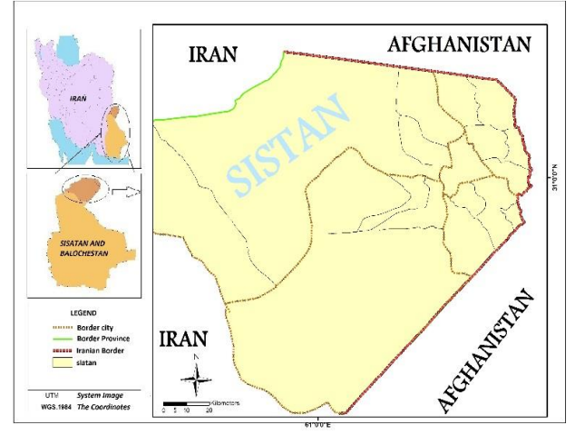
Figure 1. Rural areas of the sample community in Sistan region

The Sistan region and its capital, Zabol, according to the latest administrative divisions in 2012, is comprised of five counties of Zabol, Zehak, Hirmand, Hamoon, and Nimroz. The region has an area of 15197 square kilometers in latitude of 30° 5' to 31° 28' EW, and longitude of 60^{\circ} 15' to 61^{\circ} 50' in southeast Iran, and the northernmost part of Sistan and Baluchestan province (Fig. 1). The province borders Afghanistan and Southern Khorasan in north, and Kerman province in west (Sohrabi & Shirazi Gilani, 2007). The climate in the entire area is hot and dry, with an average annual temperature of 21.8 °C, and average annual rainfall of 58.7 mm. Sistan 120-day wind is among the most wellknown local winds in Iran which has an unavoidable impact on all ecological, economic, and social aspects of the region (Khosravi, 2008). The main activity of the people in the Sistan region is agriculture, which thanks to Helmand River and sedimentary plain of Sistan, has been the main economic activity across the prairie.