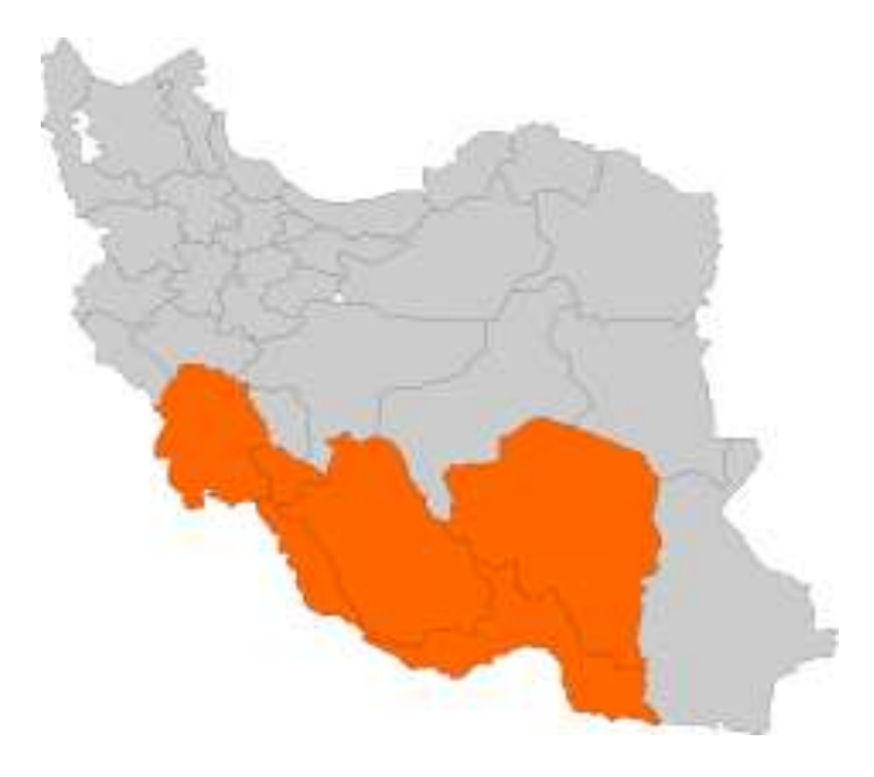
Figure 1. The study area of effective factors in the investment process by women entrepreneurs in the southern villages of the country using the three-pronged model

Table 4 mentioned the cities of Fars, Kerman, Hormozgan, Bushehr, Kohkiloyeh and Boyer Ahmad provinces and did not include the cities of provinces including Sistan and Baluchestan and Khuzestan, about which no agreement was reached. Figure 2 and table 4 depict the study area.